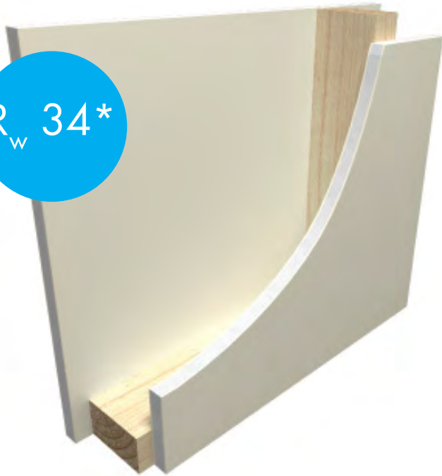
ACOUSTIC PERFORMANCE UN-INSULATED WALL "AUDIBLE SOUND"